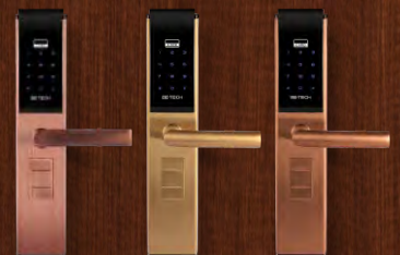
Red Bronze PVD Gold Rose Gold

Unlock your life with smart solution Leave your home security to Be-Tech